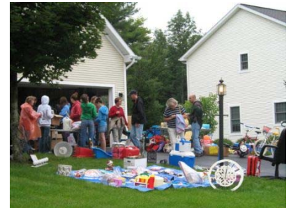
GARAGE SALE PHOTOS